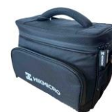
M/G/SP Series Pouch HM-SP01-POUCH

COMPLIANCE NOTICE: The thermal series products might be subject to export controls in various countries or regions, including without limitation, the United States, European Union, United Kingdom and/or other member countries of the Wassenaar Arrangement. Please consult your professional legal or compliance expert or local government authorities for any necessary export license requirements if you intend to transfer, export, re-export the thermal series products between different countries.