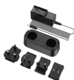
M Series Charging Base HM-5202ZC