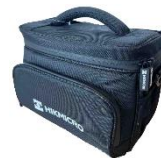
M/G/SP Series Pouch HM-SP01-POUCH

COMPLIANCE NOTICE: The thermal series products might be subject to export controls in various countries or regions, including without limitation, the United States, European Union, United Kingdom and/or other member countries of the Wassenaar Arrangement. Please consult your professional legal or compliance expert or local government authorities for any necessary export license requirements if you intend to transfer, export, re-export the thermal series products between different countries.