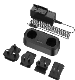
M Series Charging Base HM-5202ZC