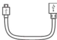
USB 2.0 A to USB Type-C Cable (× 1)