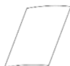
HIKMICRO Card (× 1)