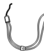
Wrist Strap (× 1)