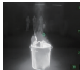
Black &amp; White

For initial fire attack and rescue operations; colors represent temperature.