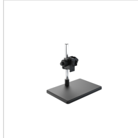
HM-AFBR07 Bracket for R&D Box Camera

COMPLIANCE NOTICE: The thermal series products might be subject to export controls in various countries or regions, including without limitation, the United States, European Union, United Kingdom and/or other member countries of the Wassenaar Arrangement. Please consult your professional legal or compliance expert or local government authorities for any necessary export license requirements if you intend to transfer, export, re-export the thermal series products between different countries.