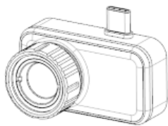
Thermal Imager (x 1)