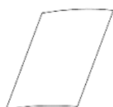
Calibration Certificate (× 1)