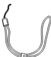
Wrist Strap (× 1)