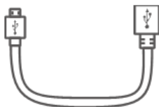
USB 2.0 A to USB Type-C Cable (× 1)