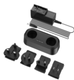
M Series Charging Base HM-5202ZC