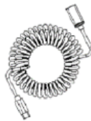
Extension Cord (x 1)