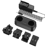
M Series Charging Base HM-5202ZC