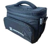
M/G/SP Series Pouch HM-SP01-POUCH

COMPLIANCE NOTICE: The thermal series products might be subject to export controls in various countries or regions, including without limitation, the United States, European Union, United Kingdom and/or other member countries of the Wassenaar Arrangement. Please consult your professional legal or compliance expert or local government authorities for any necessary export license requirements if you intend to transfer, export, re-export the thermal series products between different countries.