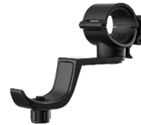
HM-GRYPHON-IRB01 IR Torch Bracket

COMPLIANCE NOTICE: The thermal series products might be subject to export controls in various countries or regions, including without limitation, the United States, European Union, United Kingdom and/or other member countries of the Wassenaar Arrangement. Please consult your professional legal or compliance expert or local government authorities for any necessary export license requirements if you intend to transfer, export, re-export the thermal series products between different countries.