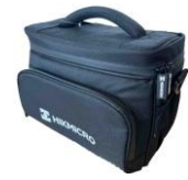
M/G/SP Series Pouch HM-SP01-POUCH

COMPLIANCE NOTICE: The thermal series products might be subject to export controls in various countries or regions, including without limitation, the United States, European Union, United Kingdom and/or other member countries of the Wassenaar Arrangement. Please consult your professional legal or compliance expert or local government authorities for any necessary export license requirements if you intend to transfer, export, re-export the thermal series products between different countries.