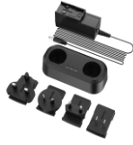
M Series Charging Base HM-5202ZC