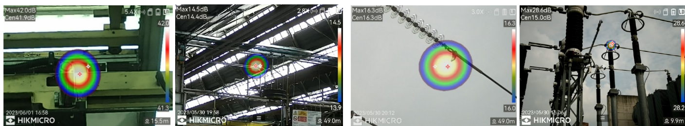
Gas Leak Detection