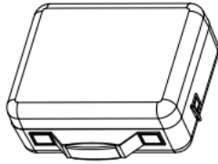
Carrying case (x1)