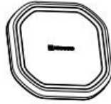
MIC protective case (X1)