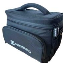
HM-SP01-POUCH M/G/SP Series Pouch