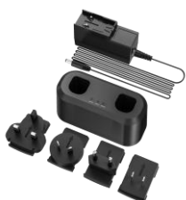
HM-5202ZC2 G Series Charging Base