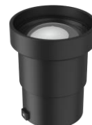
HM-G630-LENS1 3× telephoto lens, for G41 and G61