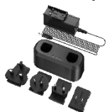
HM-5202ZC2 G Series Charging Base