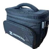
HM-SP01-POUCH M/G/SP Series Pouch