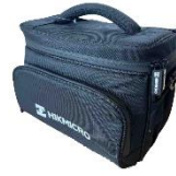
HM-SP01-POUCH M/G/SP Series Pouch