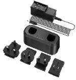
HM-5202ZC2 G Series Charging Base