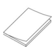
Quick Start Guide (× 1)