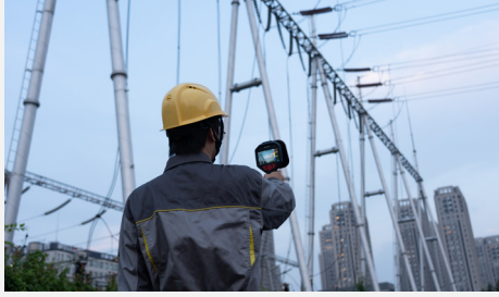
Partial Discharge Detection