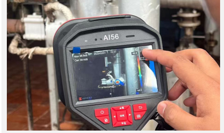
Gas Leakage Detection