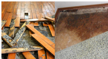
Leak Under The Floor