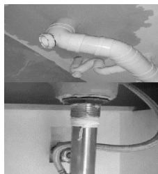
Water Supply Pipe Leakage/ Water Pipe Leakage