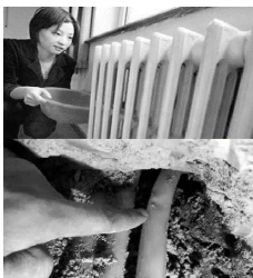
Heating Pipes/ Underfloor Heating Pipe Leaks