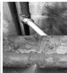
Fire Sprinkler System