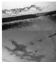
Roofs And Walls, Water Seepage In The Ground