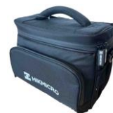
M/G/SP Series Pouch HM-SP01-POUCH

COMPLIANCE NOTICE: The thermal series products might be subject to export controls in various countries or regions, including without limitation, the United States, European Union, United Kingdom and/or other member countries of the Wassenaar Arrangement. Please consult your professional legal or compliance expert or local government authorities for any necessary export license requirements if you intend to transfer, export, re-export the thermal series products between different countries.