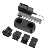
M Series Charging Base HM-5202ZC